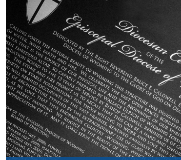
Wayfinding Signage & Blueprint Reproductions