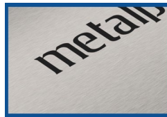
SATIN semi-gloss medium reflective material