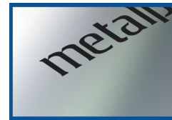
GLOSS highly reflective, mirror-like