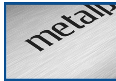
# 4 brushed to resemble a stainless steel finish