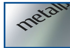
GLOSS highly reflective, mirror-like