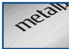
# 4 brushed to resemble a stainless steel finish