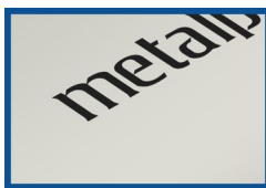
MATTE non-reflective with dull finish